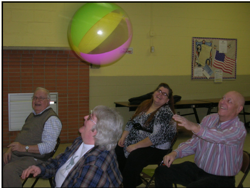
Chair Volleyball is played every Tuesday morning at Zerger Hall Senior Center at 10 a.m. and you can see from their smiles that these folks are having a ball. It is great gentle exercise and fun. You don't need to call ahead, just show up before 10 and have a wonderful time with some wonderful folks.